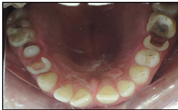
Figure 1. Preparation of the teeth for endocrown.

For endocrown preparations temporary filling restorations removed. The preparation consisted of a circular equigingival butt-joint margin and central retention cavity into the entire pulp chamber constructing both the crown and the core as a single unit (Figure 1). After cavity preparations, flowable composite (Filtek TM Bulk Fill Flowable Restorative, 3M ESPE GmbH, Neuss, Germany) were applied into the isolated cavities to eliminate the undercuts. The appropriate reduction of the buccal and lingual walls was done and interocclusal space was carefully evaluated. Occlusal reduction was done to achieve a clearance of 2 mm.