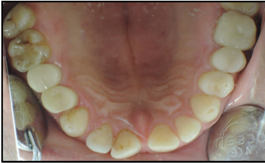
Figure 3. Clinical view of the final restorations from occlusal aspect

After cementation procedure, clinical and radiographic evaluation was done (Figure 3) and a one year follow up showed no secondary caries, fracture, discoloration or loosening/decementation of the crowns.