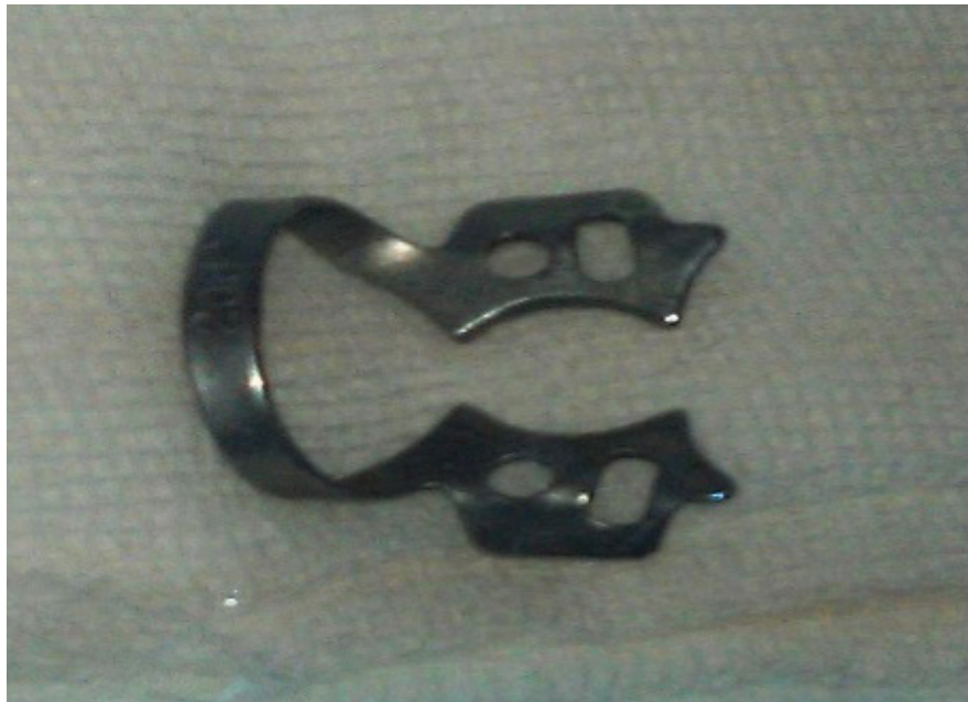
Figure 2. Ingested rubber dam clamp

On the third day, he was allowed to feed orally and he didn't experience any problems. He was discharged on the fourth day. On the one week follow-up the patient told that, he didn't feel any discomfort and he could feed himself without any problem. The otolaryngologists agreed that he was completely healed and no more follow ups were necessary. The lower right second molar was extracted due to a vertical fracture.