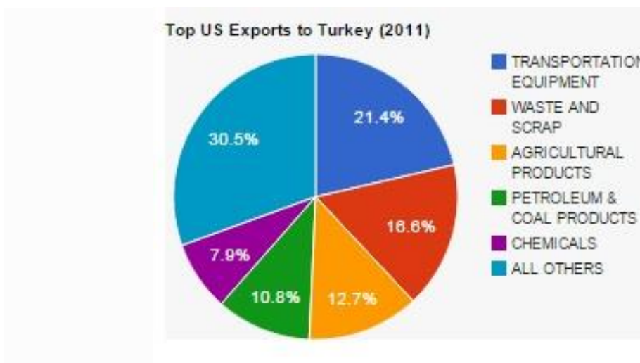
Table 4.1 : Top US Exports to Turkey (2011) (Export.gov, 2011)

Then, in 2013 Trade and Investment Framework Agreement was signed between Ankara and Washington. Before this Trade and Investment Framework Agreement is a mechanism between Turkey and the US, where the experts on both sides come together to discuss the agenda issues. IX. TIFA (Trade and Investment Talks) meeting was held in Washington D.C. on 21 st of February in 2013 (Turkey Ministry of Economy, 2015). In this respect, according to exports data; USA was Turkey’s 9 th largest goods export market in 2012 and Turkish goods exports to USA in 2012 were 5.6 billion $, up 22% (4.6 billion $) from 2011, besides in terms of imports data; USA was Turkey’s 4 th largest supplier of goods imports in 2012 and Turkish goods imports from USA totaled 14 billion $ in 2012, decreased 12 % (16 billion $) compare to 2011 (Ibid.,Turkey Ministry of Economy, 2015). Generally foreign trade relations between Turkey and USA entered in to a progressive trend during last period.