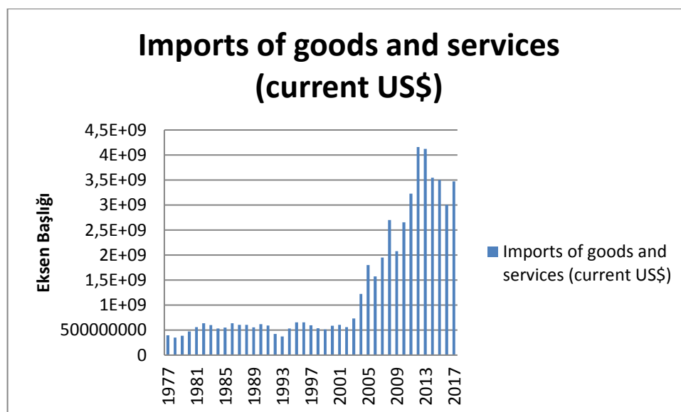
Figure 3.5: What does Mauritania import? (2016)

annual rate of -2.4%, from $ 3.93 billion in 2011 to $ 3.51 billion in 2016. This is refined oil, which accounts for 7.02% of Mauritania's total imports, followed by locomotives. 6.27%. The main sources of imports to Mauritania are China ($ 848 million), the United States ($ 295 million), the United Arab Emirates ($ 213 million), Morocco ($ 198 million) and the United States. France ($ 178 million).