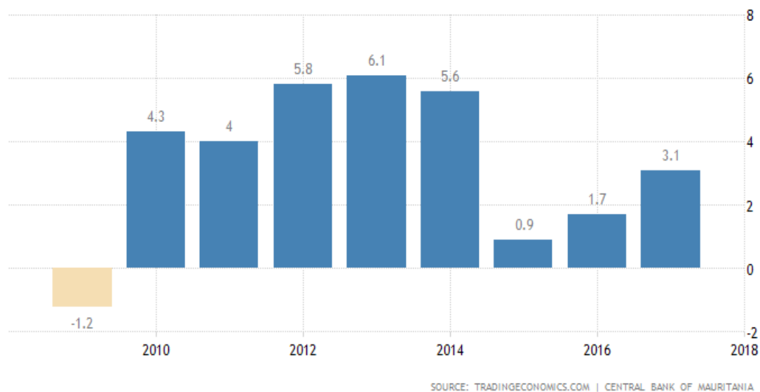
Figure 3.3: Mauritania GDP Annual Growth Rate

funds and technical assistance. They are sensitive to fluctuations in the global market as well. (moci, 2018).