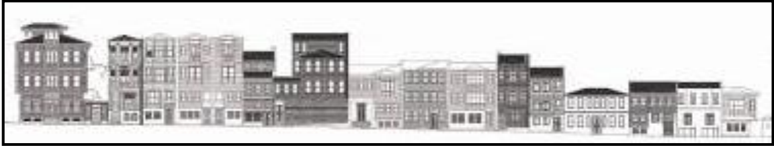
Drawing 3: An example of surveying and restoration work on the street scale, Istanbul Fatih, Süleymaniye.