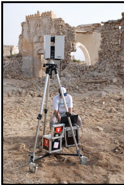
Photograph 1: Acquiring data via laser scanning

When documentation and surveying works are to be conducted in protected sites larger than a specific size, virtual surveying – surveying acquired through 3-dimensional laser scanning – should be preferred as it is more efficient, effective, healthy, accurate and fast than other surveying methods.