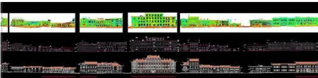
Drawing 2: Street silhouette of several city blocks (In area-wide works, project design process takes less time than expected and the prepared projects are in accurate scale and level.)