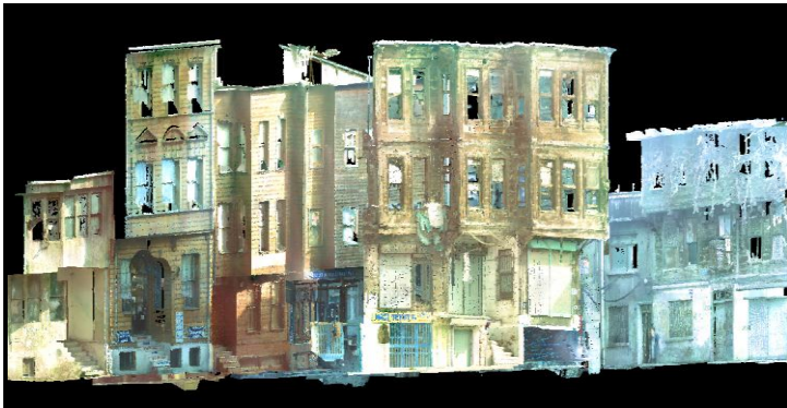
Drawing 1: Street silhouette acquired via laser scanning. (This image is in sheer scale and level, and it can be brought to any desired scale.), Istanbul Fatih, Süleymaniye.