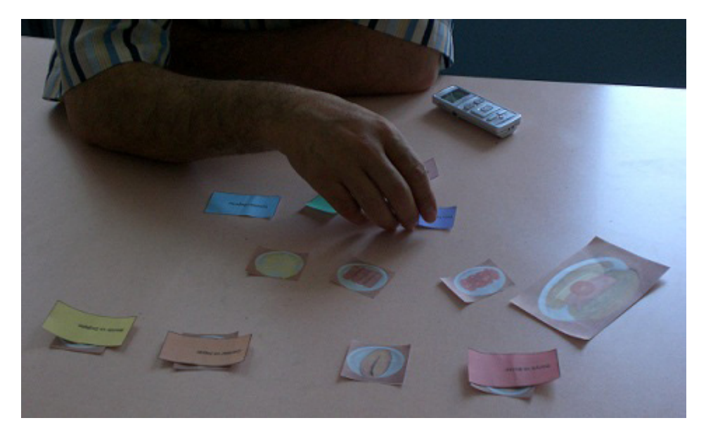
Fig. 4. A snapshot from the Meal for a Year game activity when a teacher was matching learning areas with the ingredients

The teachers had to form an imaginary sandwich by matching the given food ingredients (4 types of bread with a group of 3 ingredients: tomato, cheese, salami) with 7 learning areas in the curriculum (see Figure 4). After matching, teachers were given scenarios to solve where students refused to eat sandwiches or got sick after eating them. By this game activity, it was mainly aimed to understand the teachers' perceptions of the relationship among the learning areas (organizational structure of the curriculum) and the problems in learning process and the sources of these problems.