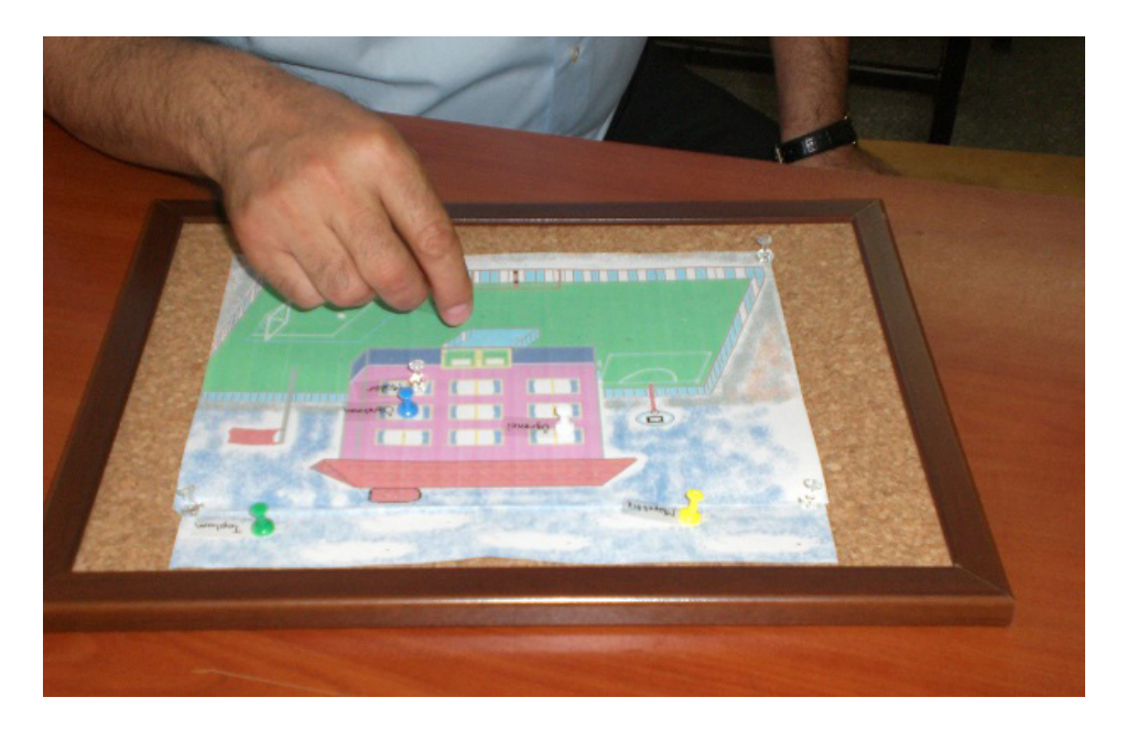
Fig. 1. A snapshot from a teacher's placement in the School Alive game activity

The teachers were asked to place the slips symbolizing the parent, student, school principal, inspector, teacher and society onto the school layout (see Figure 1). After that, the slip symbolizing the teacher was removed from the picture and the teachers were asked to put other slips to fill up the space of the teacher. Lastly, the teachers were asked to place all the slips again according to the curriculum. As a result, both the teachers' perceptions of parents, student, school principal, inspector, teacher and society and their perceptions of the references in the curriculum regarding the interrelationships among these, and thus the correspondence level of their perceptions with the curriculum were understood.