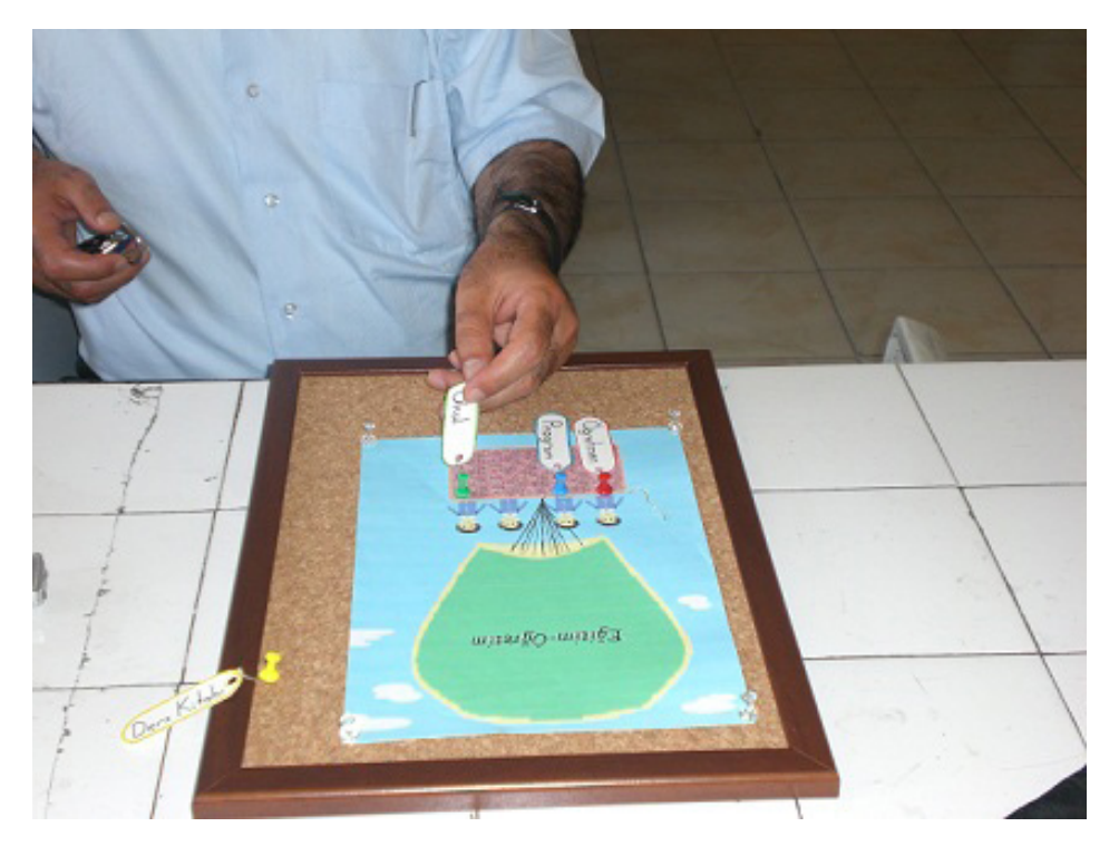
Fig. 2. A snapshot from a teacher's way of saving the balloon by throwing the weight symbolizing the school in the Education Balloon game activity

According to the scenario where the education balloon was falling down, the teachers had to 'save' the balloon by throwing 4 weights symbolizing the school, curriculum, teacher and textbook one by one (see Figure 2). The teachers were provided with an environment where they were expected to make a priority order among the school, curriculum, teacher and textbook. By this way, how these teachers perceived the relationship among the concepts above, how much and for what they needed the curriculum and how they perceived the role of the teacher in education and teaching were understood.