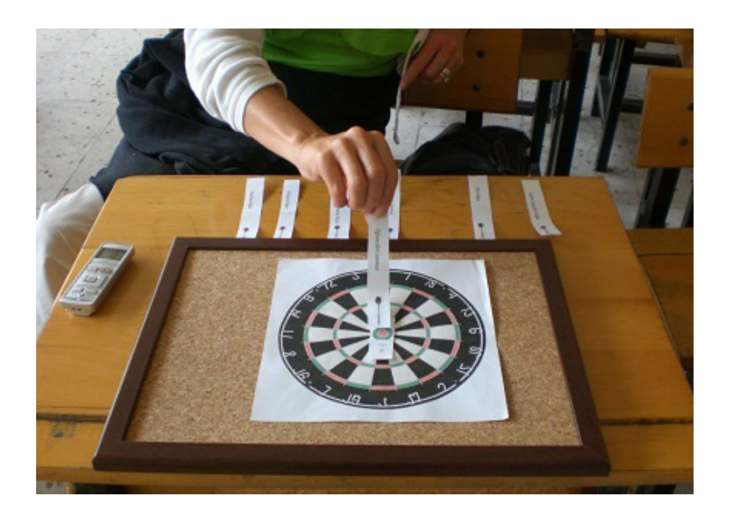
Fig. 6.A snapshot from the Free Throw game activity when a teacher is trying to hit the misconception she has identified by the professional competency she has chosen in order to eradicate the misconception