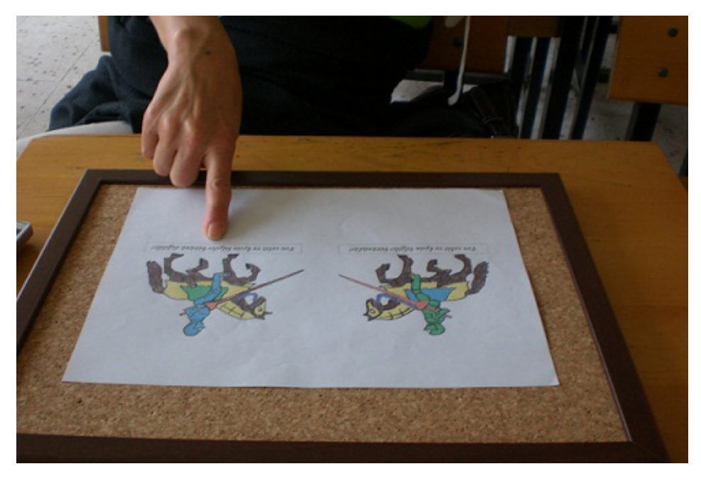
Fig. 3. A snapshot of the moment that a teacher was making an explanation regarding the warrior that she supported in the Warriors game activity

The warriors and the discourses supported by the warriors in three rounds are given in Table 2. At first, the teachers were expected to take the side of the warrior that they supported and then they were asked which warrior's side the curriculum takes. As a result, the teachers provided information especially on how they perceived Scientific Knowledge, The Principle of 'Little but Essential Knowledge' and constructivism and they questioned the internal consistency of the curriculum concerning these.