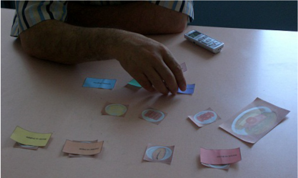
Fig. 4. A snapshot from the Meal for a Year game activity when a teacher was matching learning areas with the ingredients

The teachers had to form an imaginary sandwich by matching the given food ingredients (4 types of bread with a group of 3 ingredients: tomato, cheese, salami) with 7 learning areas in the curriculum (see Figure 4). After matching, teachers were given scenarios to solve where students refused to eat sandwiches or got sick after eating them. By this game activity, it was mainly aimed to understand the teachers' perceptions of the relationship among the learning areas (organizational structure of the curriculum) and the problems in learning process and the sources of these problems.