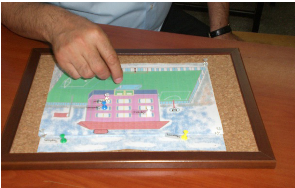
Fig. 1. A snapshot from a teacher's placement in the School Alive game activity

The teachers were asked to place the slips symbolizing the parent, student, school principal, inspector, teacher and society onto the school layout (see Figure 1). After that, the slip symbolizing the teacher was removed from the picture and the teachers were asked to put other slips to fill up the space of the teacher. Lastly, the teachers were asked to place all the slips again according to the curriculum. As a result, both the teachers' perceptions of parents, student, school principal, inspector, teacher and society and their perceptions of the references in the curriculum regarding the interrelationships among these, and thus the correspondence level of their perceptions with the curriculum were understood.