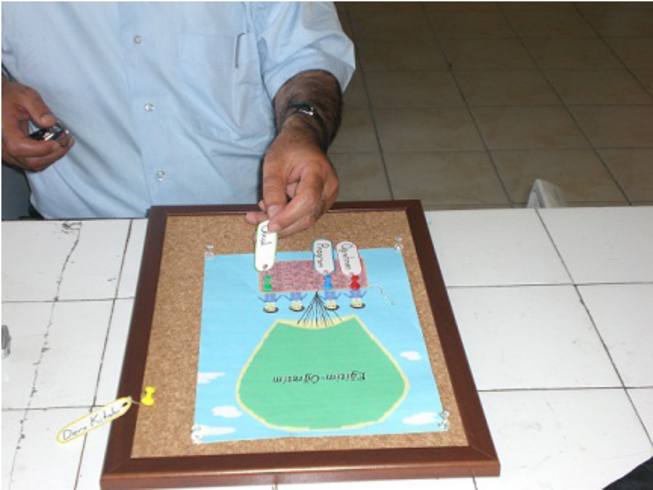
Fig. 2. A snapshot from a teacher's way of saving the balloon by throwing the weight symbolizing the school in the Education Balloon game activity

According to the scenario where the education balloon was falling down, the teachers had to ‘save’ the balloon by throwing 4 weights symbolizing the school, curriculum, teacher and textbook one by one (see Figure 2). The teachers were provided with an environment where they were expected to make a priority order among the school, curriculum, teacher and textbook. By this way, how these teachers perceived the relationship among the concepts above, how much and for what they needed the curriculum and how they perceived the role of the teacher in education and teaching were understood.