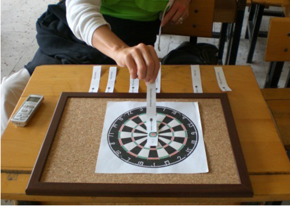
Fig. 6.A snapshot from the Free Throw game activity when a teacher is trying to hit the misconception she has identified by the professional competency she has chosen in order to eradicate the misconception