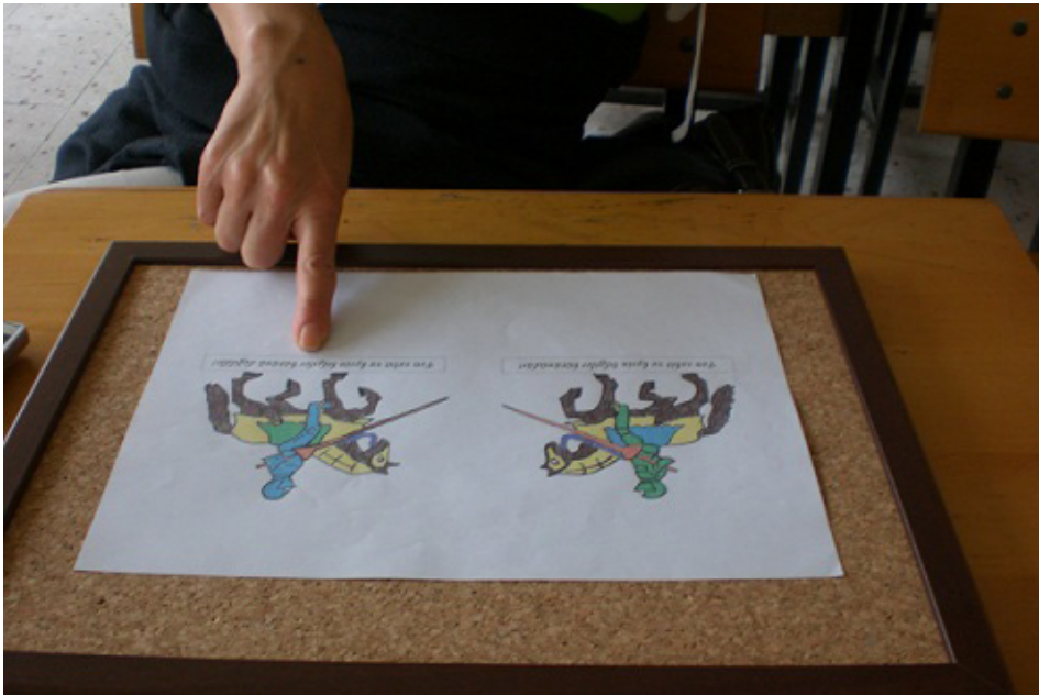
Fig. 3. A snapshot of the moment that a teacher was making an explanation regarding the warrior that she supported in the Warriors game activity

The warriors and the discourses supported by the warriors in three rounds are given in Table 2. At first, the teachers were expected to take the side of the warrior that they supported and then they were asked which warrior's side the curriculum takes. As a result, the teachers provided information especially on how they perceived Scientific Knowledge, The Principle of 'Little but Essential Knowledge' and constructivism and they questioned the internal consistency of the curriculum concerning these.