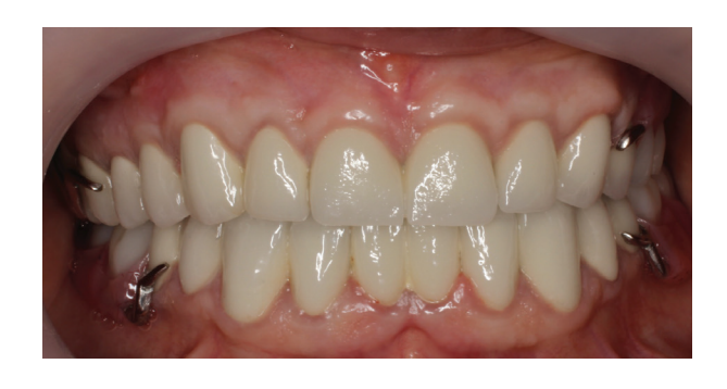
Resim 5: Tedavi bitimi sonrası alınan fotoğraf