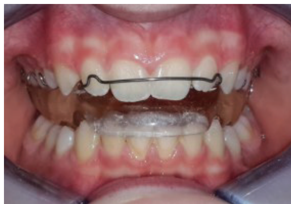
Figure 3: The Monoblock appliance and the reactivation after upper

and the retention phase begun. Fixed lingual retainers were bonded canine to canine on upper and lower arch and essix retainers were applied (Fig 4). As a result of dental grade II subdivision, increased overbite in the case of 2 years and 8 months of treatment as a result of dental class I relationships with normal overbite and overexpression has been achieved a good.