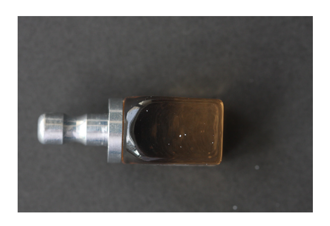
Figure 2: Vita Suprinity block.

Vita and Dentsply, introduced zirconia reinforced lithium disilicate glass ceramic blocks in 2013. The brand name of zirconia reinforced lithium disilicate glass ceramic block of Vita is Vita Suprinity (Figure 2).