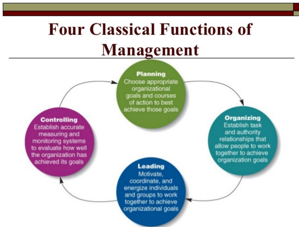
Figure 3. Management Functions.